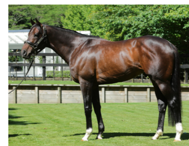
SATONO ALADDIN (JPN)

This year's South Island Sale catalogue features seven yearlings by Mongolian Falcon.