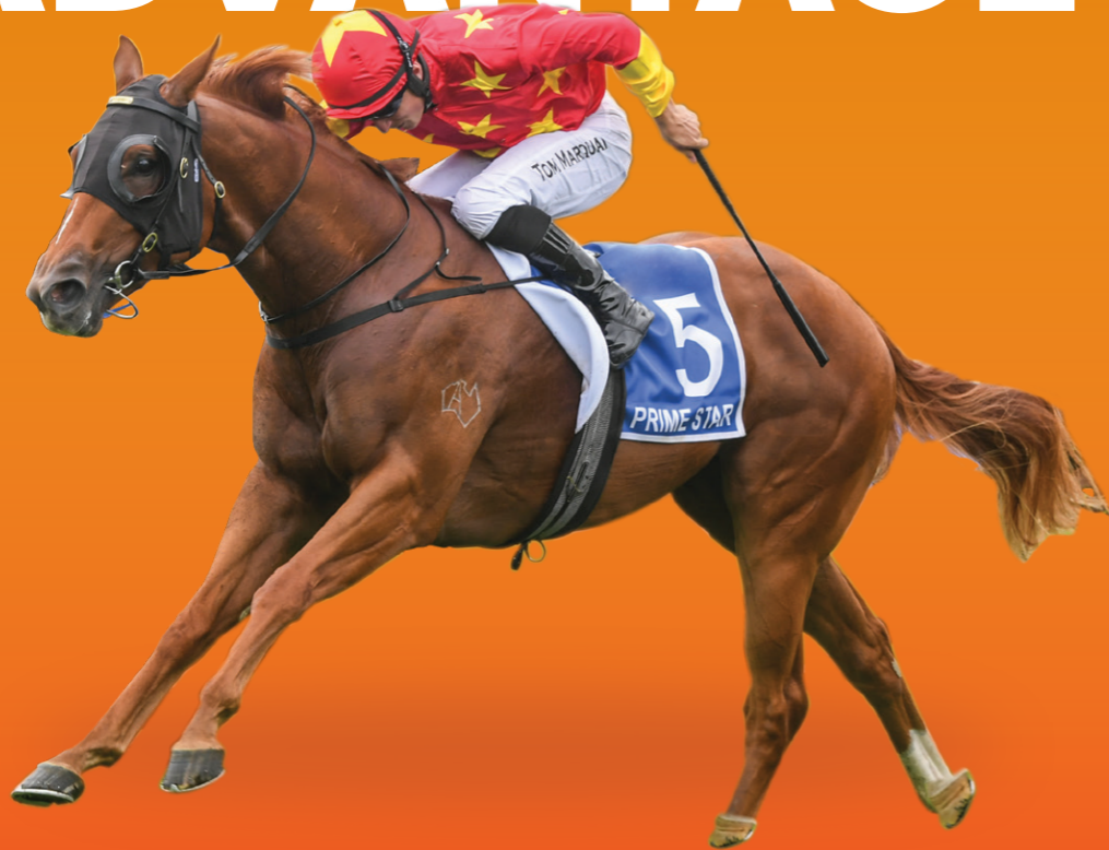
Prime Star - Winner of the 2020 $2M Millennium Raised on Livamol Feed Optimiser Pellets