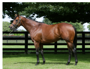
CHARM SPIRIT (IRE)