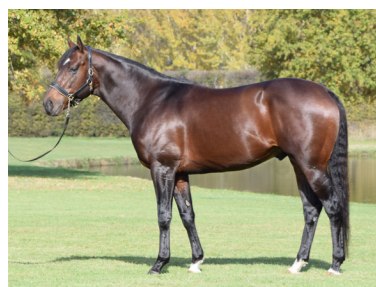
WAR DECREE (USA)

There are two fillies by Time Test in the 2021 South Island Sale catalogue.