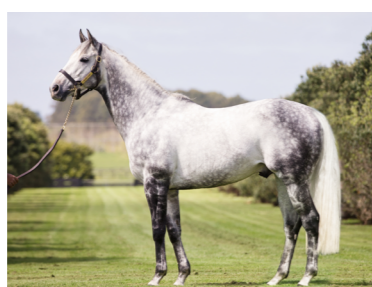
RELIABLE MAN (GB)