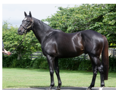
SACRED FALLS (NZ)