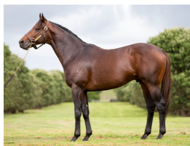
EL ROCA (AUS)