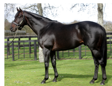
UNUSUAL SUSPECT (USA)