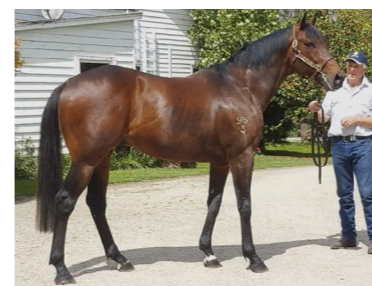
MONGOLIAN FALCON (AUS)