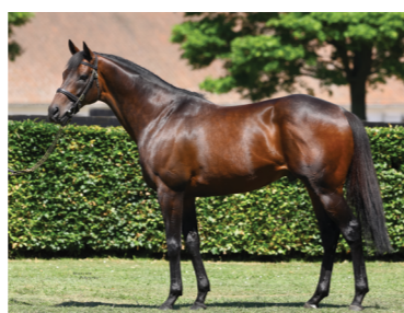
TIME TEST (GB)