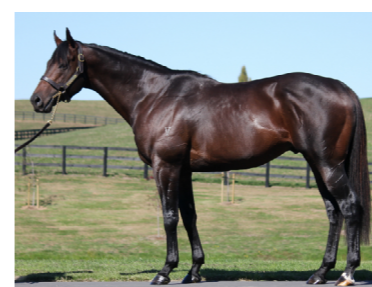
SAVILE ROW (NZ)