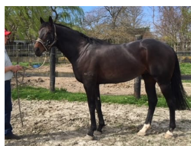
PURE CHAMPION (IRE)